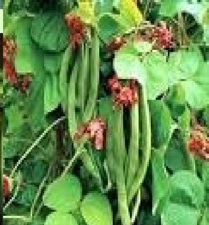
Scarlet runner bean