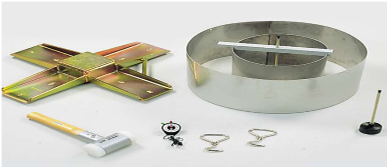
Diagram sketch of double ring infiltrometer

The ASTM standard method specifies inner and outer rings of 30 and 60 cm diameters, respectively.