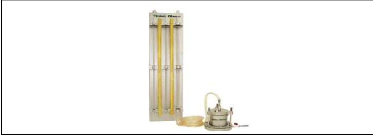
Diagram sketch of hydraulic conductivity