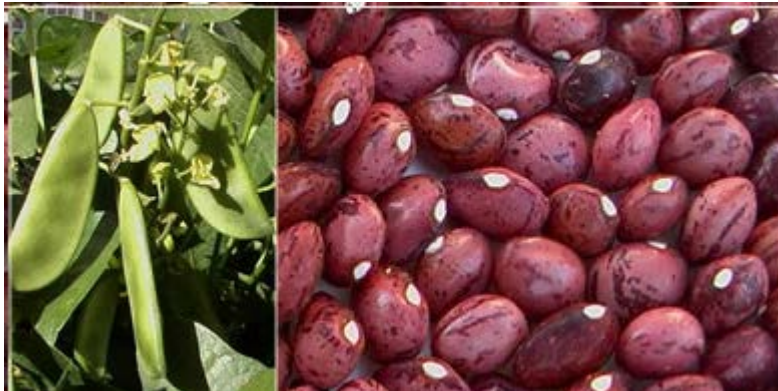
Dixie Speckled Butter Peas - Phaseolus lunatus