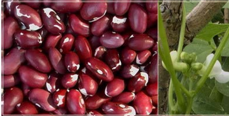
Anasazi Beans( Phaseolus vulgaris )

Apply 25 of FYM and 50 kg P and 25 kg K/ha as basal dose. 25 kg N and 25 kg of K/ha are applied between 20-25 days after sowing and application of remaining 25 kg of N is done between 40-45 days.