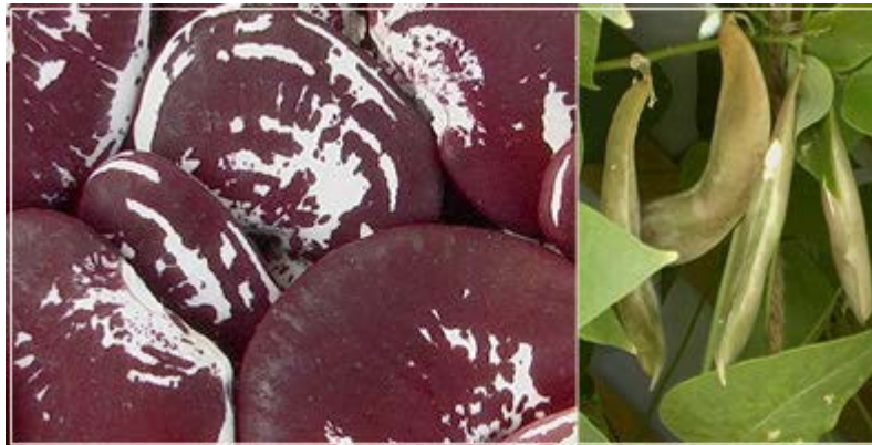
Christmas Lima Beans - Phaseolus lunatus