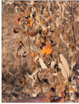
Burned leaves and flower