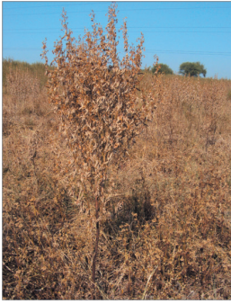
Frost affected field of arhar