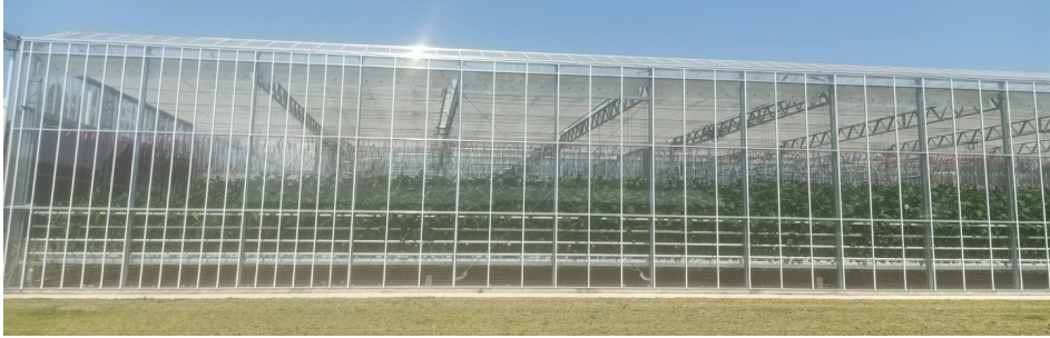
Fig. 2: Glass greenhouse