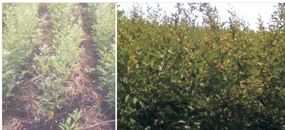
In-situ mulching of weeds in pigeon pea

production and productivity of pigeon pea. However, the yield of extra short duration cultivar (ICPL-88039) is also affected due to heavy infestation of weeds and lack of soil moisture under the rainfed farming situation in the district while the yield potential of cultivar is about 1600-1800 kg/ha. To overcome this problem, the practice of in-situ mulching may be a good approach to increase the production and productivity of pigeon pea in the district by reducing the infestation of weeds and supply of soil moisture during dry spell at the critical stage of crop growth. In view of this, short