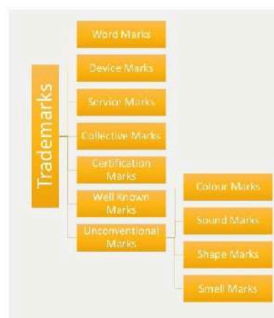
Types of Trademarks

A trademark is a sign capable of distinguishing the goods or services of one enterprise from those of other enterprises. Trademarks are protected by intellectual property rights. – WIPO