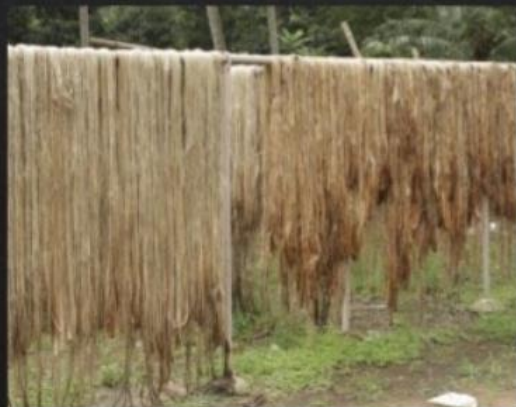
Raw Jute Drying