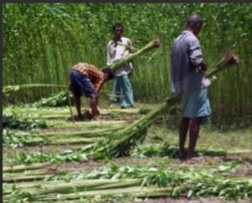
Harvested jute crops are kept in the field for defoliation