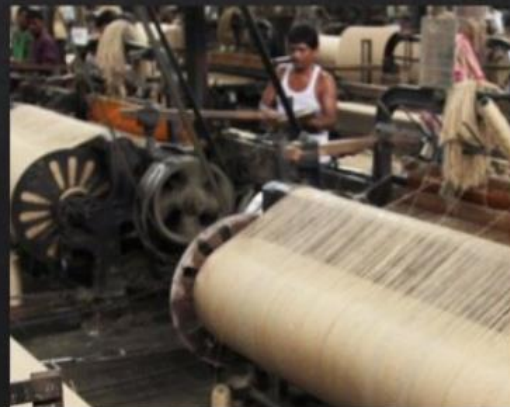
Jute Processing Industry