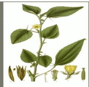
চিত্র পাট Corchorus olitorius