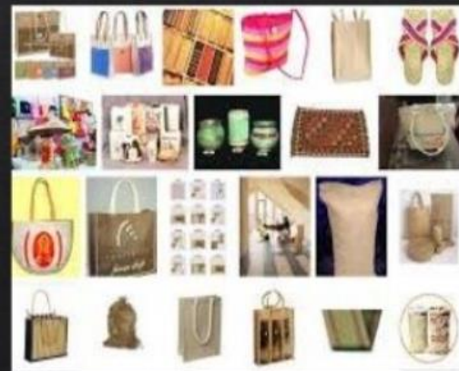
Products of Jute