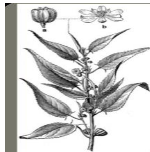
চিত্র পাট Corchorus capsularis