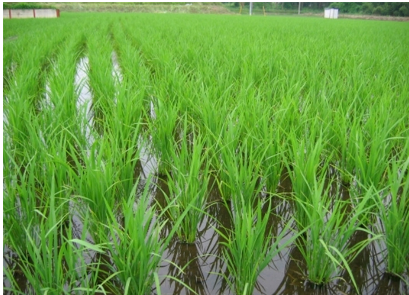
Fig. 27.2. Submerged rice field

In most areas rice fields are submerged continuously throughout the crop-growing period, though not always essential. Studies have indicated that soil saturation is sufficient for kharif rice, while submergence not exceeding 5 cm seems to be essential and adequate for rabi rice (Fig. 27.2).