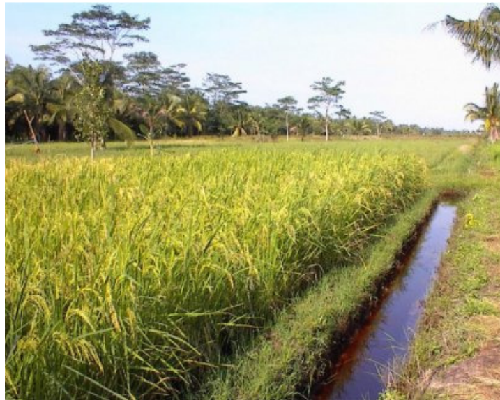
Fig. 27.1. Irrigated rice crop

Rice culture at present dominates irrigated agriculture (Fig. 27.1). About 64% of the irrigation water resources in Andhra Pradesh are used for cultivation of rice. An adequate water supply is one of the most important factors in rice production. In many parts of India including Andhra Pradesh rice plants suffer from either too much or too little water because of irregular rainfall and land topography.