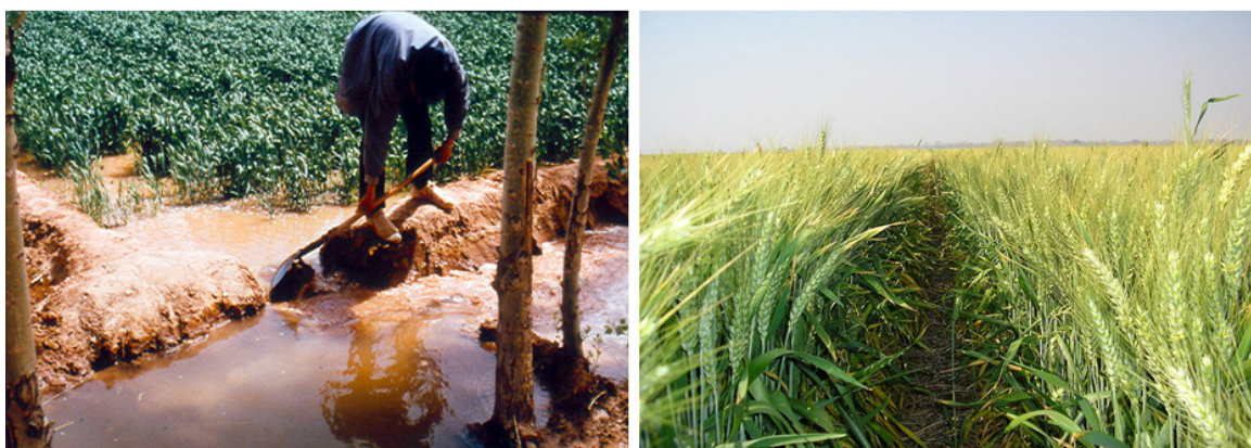
Fig. 28.1. Surface basin irrigated wheat crop

Based on soil water regime approach under south Indian condition irrigations at 25% DASM and 40 – 50% DASM under north Indian conditions were found to be optimum. Likewise irrigations at 0.75 to 1.0 IW/CPE ratio based on climatological approach were found to be optimum for many locations. An IW/CPE ratio of 1.0 was optimum at CRI stage. The critical growth stages for irrigation are crown root initiation, tillering, heading & grain formation. The seasonal crop water requirement varies between 350 to 500mm depending upon the agro-climatic zone. The recommended method of irrigation is check basin and border strip method of irrigation (Fig. 28.1).