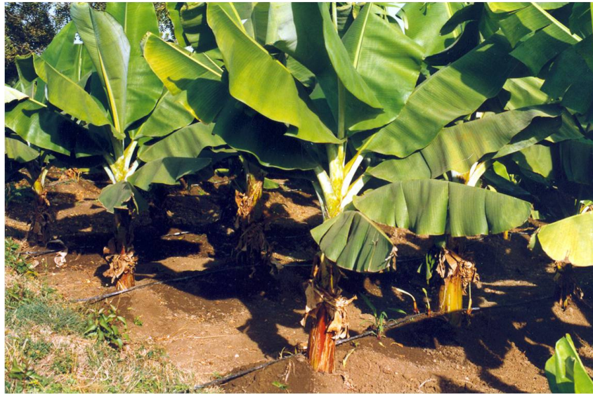
Fig. 30.2. Drip irrigated banana

Basin and furrow method of irrigation are commonly used in commercial plantations (Fig. 30.2). However, due to water scarcity conditions and higher yield realization farmers are also using drip irrigation in banana.