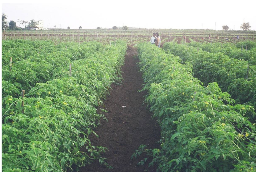
Fig. 30.3. A good crop of tomato

Surface irrigation by furrow is commonly practiced. Under sprinkler irrigation the occurrence of fungal diseases and possibly bacterial canker may become a major problem. Further, under sprinkler, fruit set may be reduced with an increase in fruit rotting. Due to the crops specific demands for a high soil water content achieved without leaf wetting, trickle or drip irrigation has been successfully applied (Fig. 30.3).