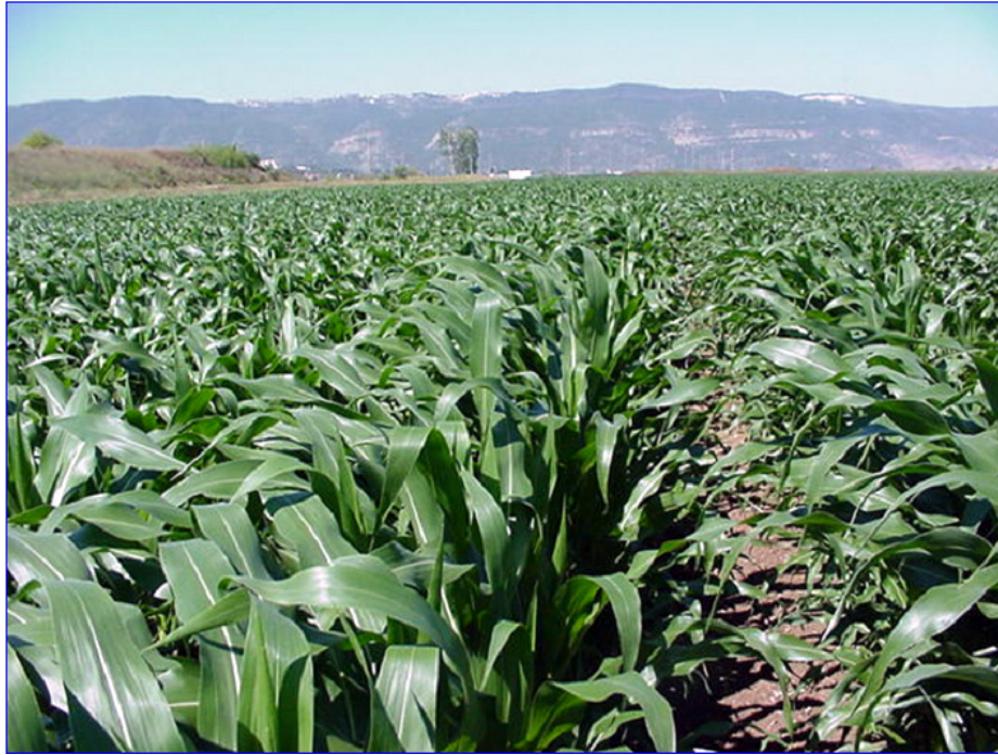
Fig. 28.2. Irrigated corn field

including tasseling-silking and pollination, mainly due to a reduction in grain number per cob. Water deficits particularly at the time of silking & pollination may result in little or no grain yield due to silk drying. Water deficits during the ripening period have marginal effect on grain yield.