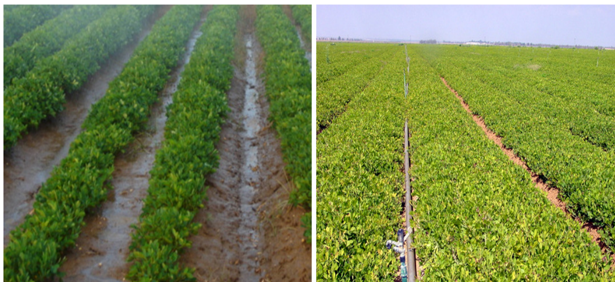
Fig. 29.2. Surface basin and sprinkler irrigated groundnut