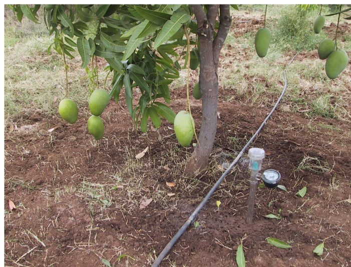
Fig. 30.1. Irrigation scheduling in mango using tensiometer readings

Most of the feeding roots are found at distances from the plant of 0.9 m to 2.6 m and at depths from soil surface to 0.90 m though root penetration was noticed up to 2 m soil depth. The basin and drip method of irrigation are commonly practiced in India (Fig. 30.1). Critical stages for water supply are flowering, pollination and fruit development. Greatest decrease in fruit yield is caused by water deficits during the flowering and fruit development period, due mainly to a reduction in number of flowers, fruit number and fruit size. For estimating crop ET begin with a crop coefficient value of 0.4 during flowering, increase it up to 0.85 in the middle of fruit growth period and decrease it to 0.60 during fruit ripening stage.