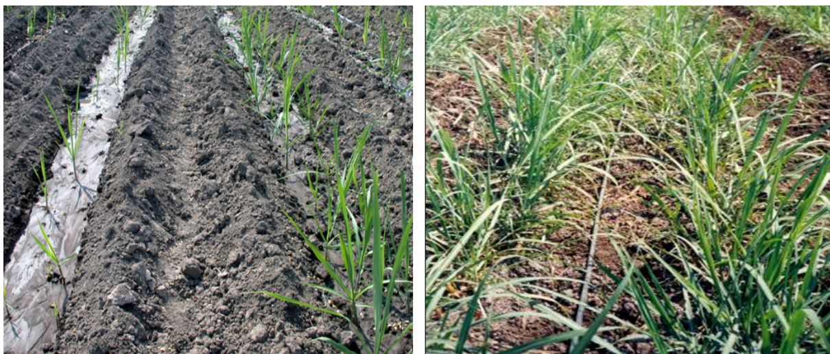
Fig. 29.1. Furrow and surface drip irrigated sugarcane