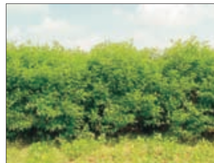
Luxuriant growth of ratoon Pigeon pea ( Cajanus cajan )