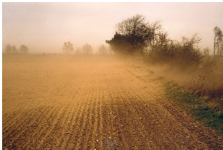
Fig. 14.1. An Illustration of Wind Erosion.

Wind erosion damages land and natural vegetation by removing soil from one place and depositing it at another location. It causes soil loss, dryness and deterioration of soil structure, nutrient and productivity losses and air pollution. Smaller particles of soil are more subject to movement by wind as silt, clay and organic matter are removed from the surface soil by strong wind, leaving the coarse, lesser productive material behind. Suspended dust and dirt are inevitably deposited over everything. It blows on and inside homes, covers roads and highways, and smothers crops. Sediment transport and deposition are significant factors in the geological changes which occur on the land around us and over long periods of time are important in the soil formation process. Most serious damage caused by wind erosion is the change in soil texture. Damage caused by wind erosion is demonstrated in Fig. 14.1.