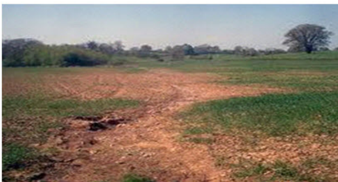
Fig. 17.1. Tilled Farmland Very Susceptible to Erosion from Rainfall.

Rainfall erosivity is a term that is used to describe the potential for soil to be washed off from disturbed, de-vegetated areas and move with into surface waters during storms. It may also be defined as the potential ability of rain to cause the erosion. It is dependent upon the physical characteristics of rainfall, which include raindrop size, drop size distribution, kinetic energy, terminal velocity, etc. For a given soil condition, the potential of two storms can be compared quantitatively, regarding soil erosion to be caused by them. The power of overland runoff flow to erode soil material is partly a property of the rainfall, and partly of the soil surface. Rainfall erosivity is highly related to soil loss. Increased rain erosivity indicates greater erosive capacity of the overland water flow. Soil erosion by running water occurs where the intensity and duration of rainstorms exceeds the capacity of the soil to infiltrate the rainfall. The potential for erosion is based on many factors which include including soil type, slope, and the energy or force of precipitation expected during the period of surface disturbance.