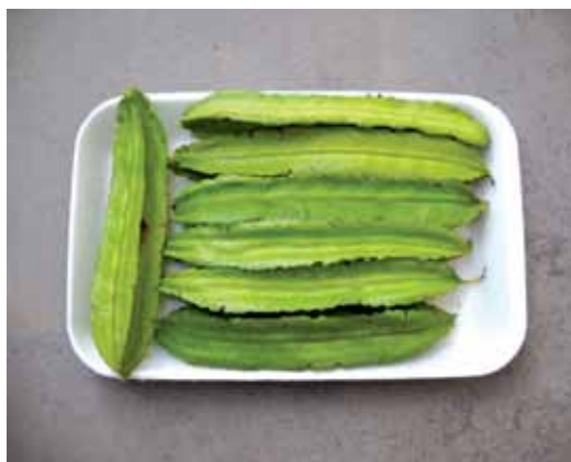
Winged bean fruits