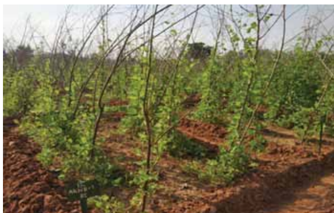
Field view of winged bean in its vegetative stage

Recognising the importance of the crop amid changing climatic conditions and increasing health awareness among the human society, winged bean is considered as one of the future crops which is likely