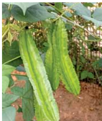
Winged bean in fruiting stage

shape that emits an aroma which is similar to asparagus.