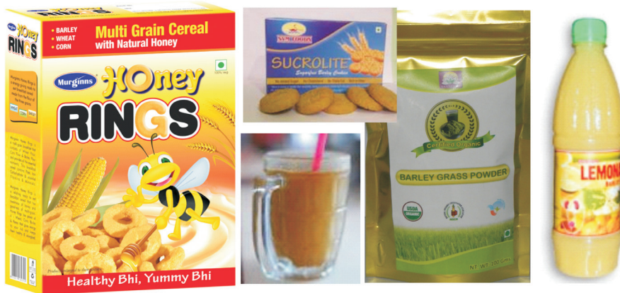
Some barley based healthy food products

to much attention being paid to wheat as food grain and as a result use of coarse cereals as food had decreased. Now, the time has come that we should pay more attention to barley and its health benefits and instead of a coarse cereal, it may be termed as a quality cereal for human food, medicinal and industrial uses. The changing lifestyles and dietary habits are leading to more and more patients with heart diseases and diabetes. In fact, India is fast becoming the diabetic capital of the world. Therefore, there is a need to include more healthier foods in the diet. Barley is one such cereal which can be integrated in traditional Indian diet to have additional health benefits.